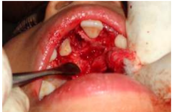
Figure 5. Empty extraction socket after extraction of mesiodens. Note palatally placed right central incisor.