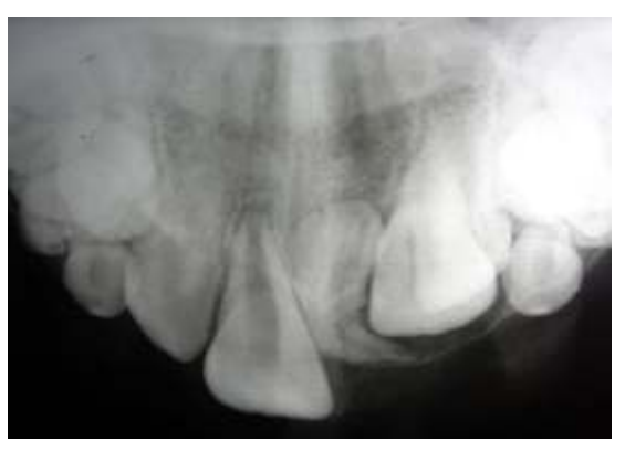
Figure 3. Maxillary occlusal radiograph showing inverted and dilacerated mesiodens hindering eruption of permanent central incisor