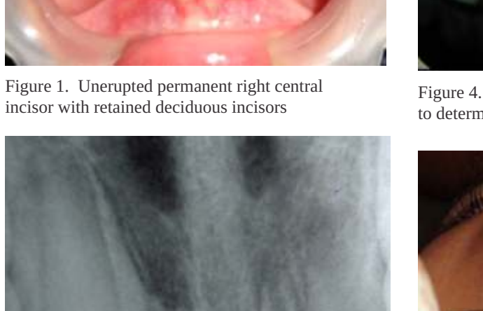
Figure 2. IOPA showing inverted and dilacerated mesiodens