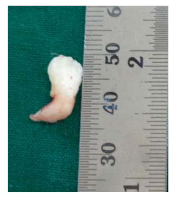
Figure 6. Dilacerated Mesiodens of 1.4 cm